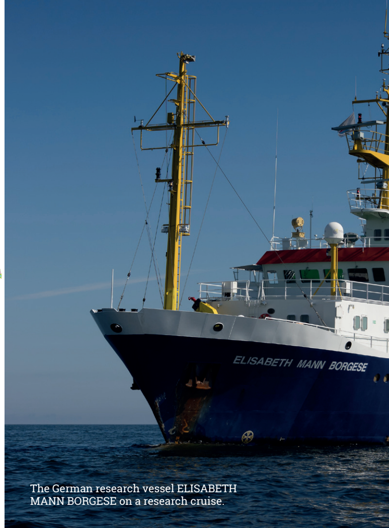
The German research vessel ELISABETH MANN BORGESE on a research cruise.