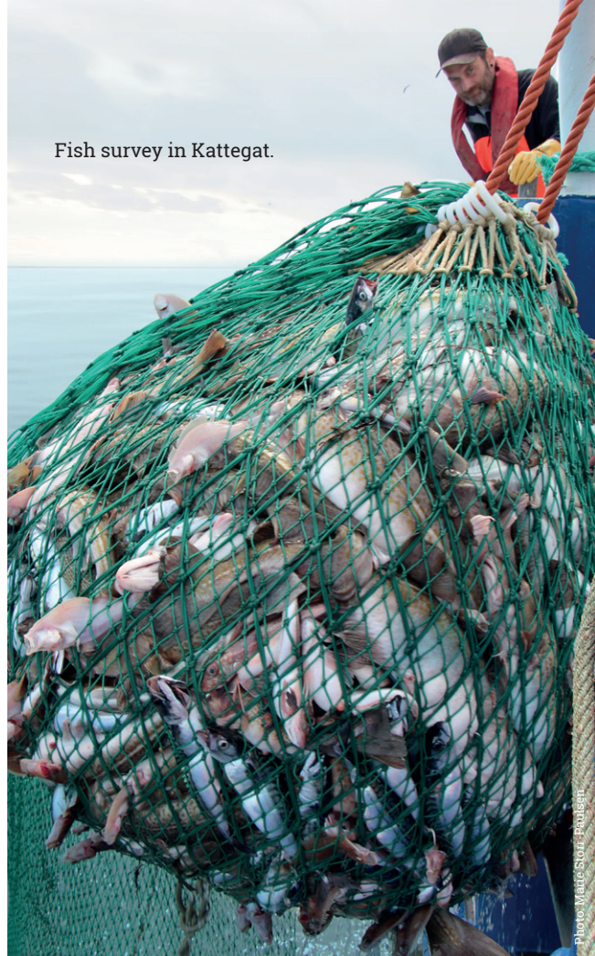
Fish survey in Kattegat.

The main development needs identified will require to: